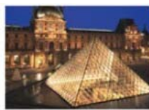
Dynamic Contrast Ratio