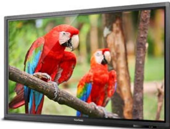
Full HD Resolution