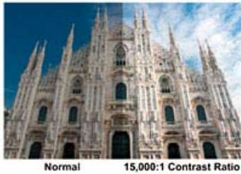
Normal 15,000:1 Contrast Ratio