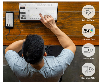
ULTRA-PORTABLE DESIGN Work and entertainment on-the-go