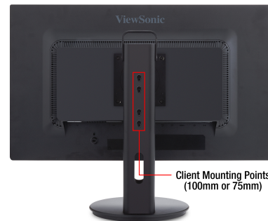
Client Mounting Points (100mm or 75mm)