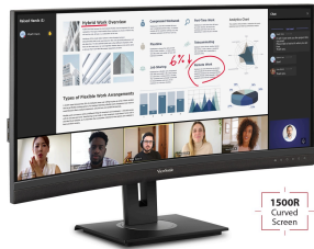
IMMERSIVE CURVED SCREEN DESIGN