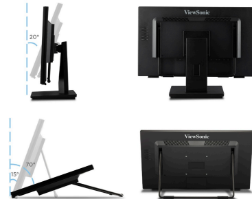
FLEXIBLE SETUP Adjust your monitor to your exact preference