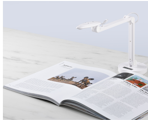
MAKE DOCUMENT VIEWING EASY WITH INTUITIVE CONTROLS