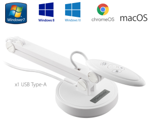
CONNECTIVITY AND COMPATIBILITY