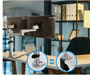
FLEXIBLE MOUNTING OPTIONS For Screens up to 24 in. / 61cm and 22 lbs. / 10kg