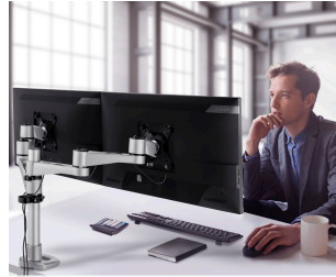
ENJOY LESS CLUTTER And Greater Productivity