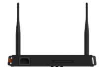
Slot-in PC VBC25-W53 / VBC25-W55