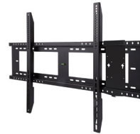
Standard Wall Mount WMK-047-2