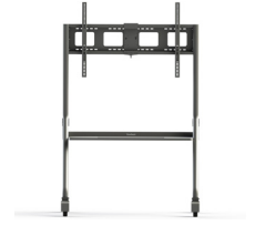
Slim Trolley Cart VB-STND-005