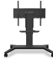
Motorized Trolley Cart VB-STND-003