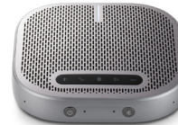
Wireless Speakerphone VB-AUD-201