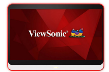
Scheduler and Signage Display EPI0521