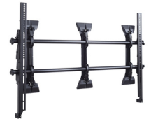
Professional Wall Mount WMK-070