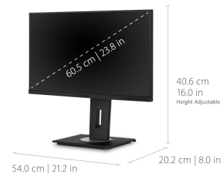
WQHD (2560x1440p) Resolution