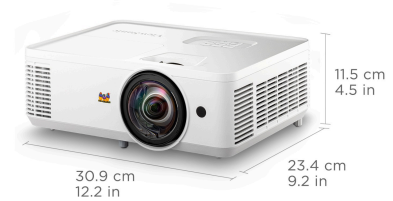
XGA (1024 X 768p) RESOLUTION