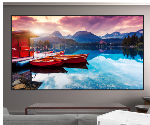
3,000 LED LUMENS AND WXGA RESOLUTION