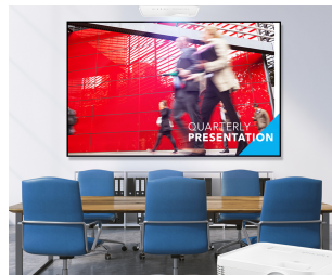
BIG SCREEN PROJECTION FOR SCHOOLS AND BUSINESSES