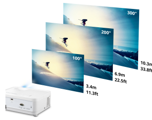
GO BIG EVEN IN SMALL SPACES

Contact Sales ViewSonic.com 888.881.8781 email: salesinfo@viewsonic.com