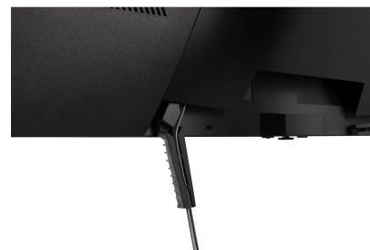
ELIMINATE CABLE DRAG Built-In Mouse Anchor