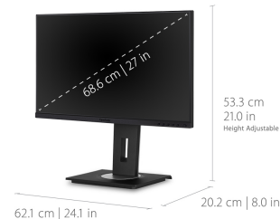
Full HD (1920x1080p) Resolution