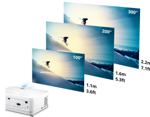
GO BIG IN SMALL SPACES WITH SHORT THROW PROJECTION