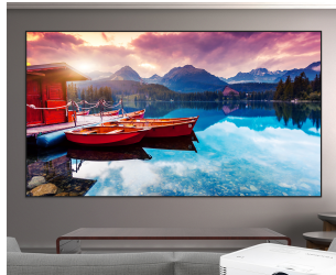
3,000 LED LUMENS AND WXGA RESOLUTION