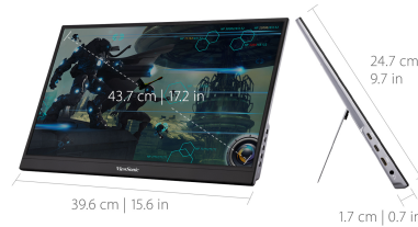
*Only 1kg | 2.2lb