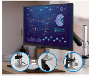
FLEXIBLE MOUNTING OPTIONS For Screens up to 32" and 22 lbs.