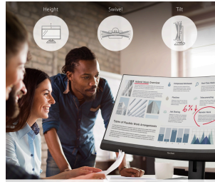
ADVANCED ERGONOMICS WITH 40° TILT More Comfort while Working