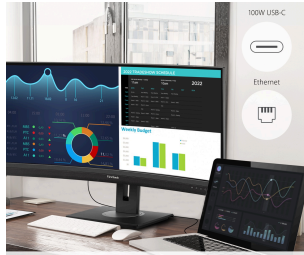
LESS CLUTTER. MORE EFFICIENCY One Cable Solution and Docking Station