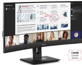
IMMERSIVE CURVED SCREEN DESIGN