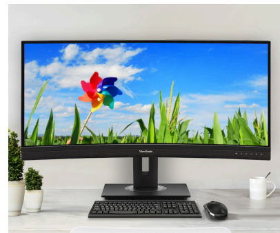
GREEN MEANS GO Paper-Based Packaging and Easy-to-Install Stand