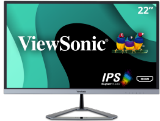
Future Proof inputs for flexible connectivity options